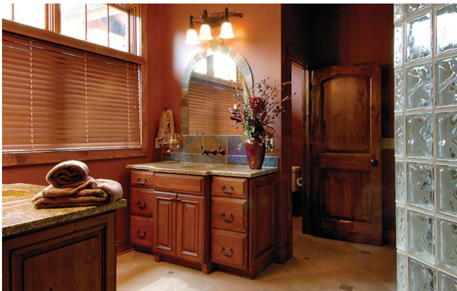
Photo courtesy Paula Kovatovich, CKD, Interior Designer, The Hearth Room.

Connected walk-in closets with custom cabinetry, adjoining laundry rooms and tranquil master bedrooms provide the ultimate convenience. "More people are dedicating cabinet accessories and organizers for pull out hampers, hair dryers, ironing boards, flat-screen TV's and other bath necessities," Kovatovich continues.