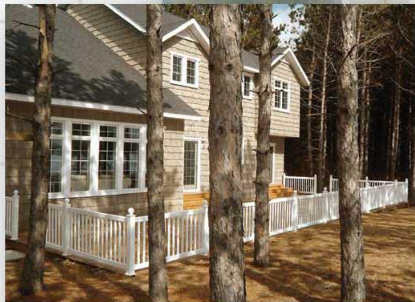
When preparing their site, the Arnos realized that, without a sandy beach, there was no need to clear a spacious lawn and instead put a broad 25-foot-deep lakeside dock and simple walkway to the water, leaving as many pine trees as possible.

by Tami Rust