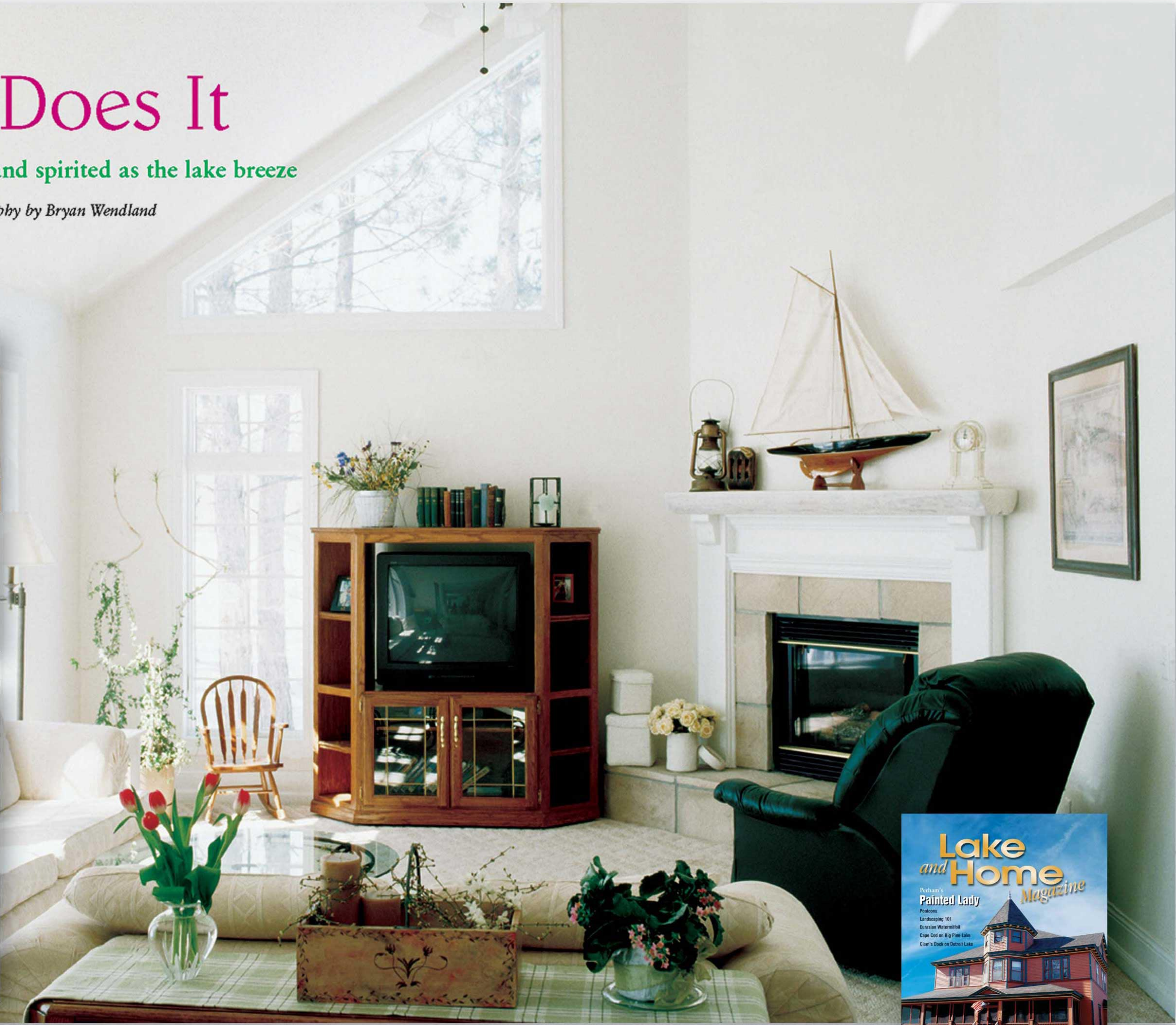
Magazine 2002 LAKE and HOME 45