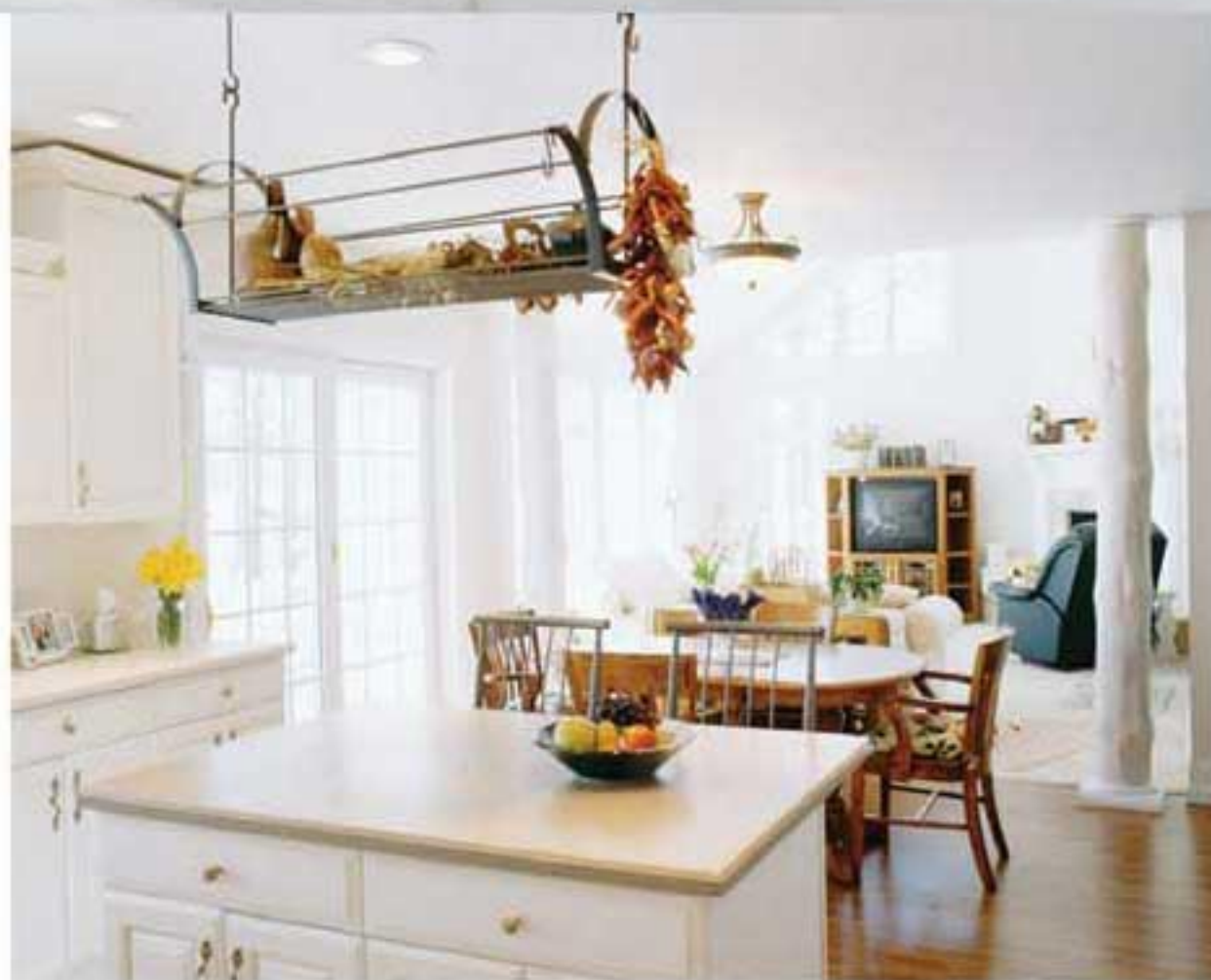
The Arnos opted for the ease of upkeep offered by wood-look laminate on the kitchen floor—at least until young sons Aaron and Anthony are older. The home's design allows Jennifer to be "connected" to the boys as they watch television in the living room and the cooks in the kitchen.

great depth and bright for interest. Instead, pine and oak hardwoods also take the modern edge off the colors. Glass doors on a corner cabinet give a view of the couple's pottery dishes. Jen's family lives in North Carolina, in an area well-served by pottery. These collections, regularly rotated for Jen's guests, have become white with dark, dark, or green wash. Chubby cast-iron and bronze by Dierckx Pottery, based in the foothills of the Tullahoma area, are both decorative and functional. The divided top windows of the family room are classic Cape Cod. On the coldest of winter days, these work-