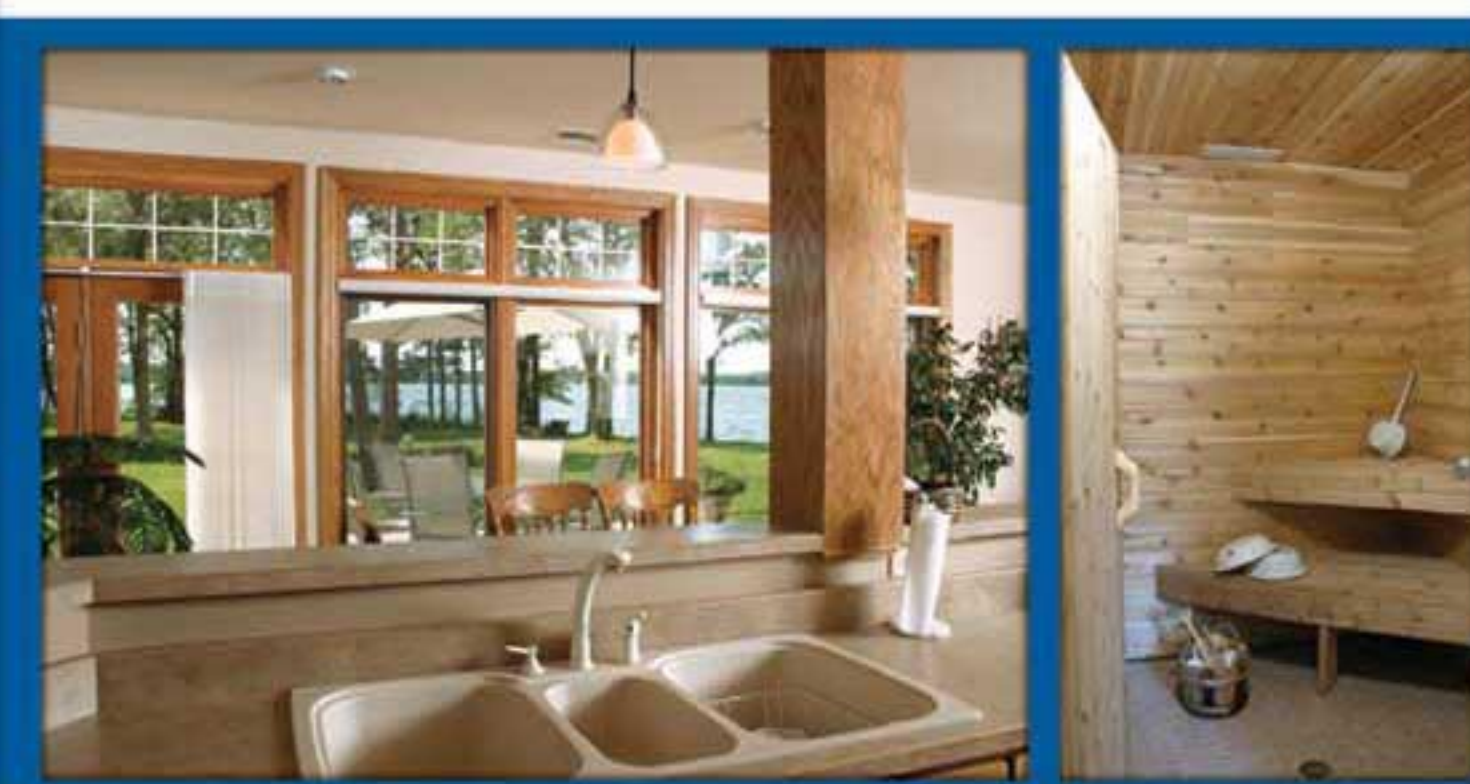
A beautiful oak staircase leads to the second floor. Beyond the kitchen and dining area is the patio where guests can sit and watch lake activities. The walk-in sauna is a mainstay in any Finnish home.

and the master bathroom with its tub, walk-in glass block shower and a separate water heater. A beautiful oak staircase leads to the second floor, which consists of two bedrooms, a TV room with track lighting and a nightstand, and a full bath that also has a skylight. A recreation room, complete with four enclosed storage areas, is located above the three-stall garage for their two college-aged sons. It also comes in handy when children come out in the summer months. Arlen and Yvonne both came from large families, Arlen has 11 siblings, and Yvonne has five.