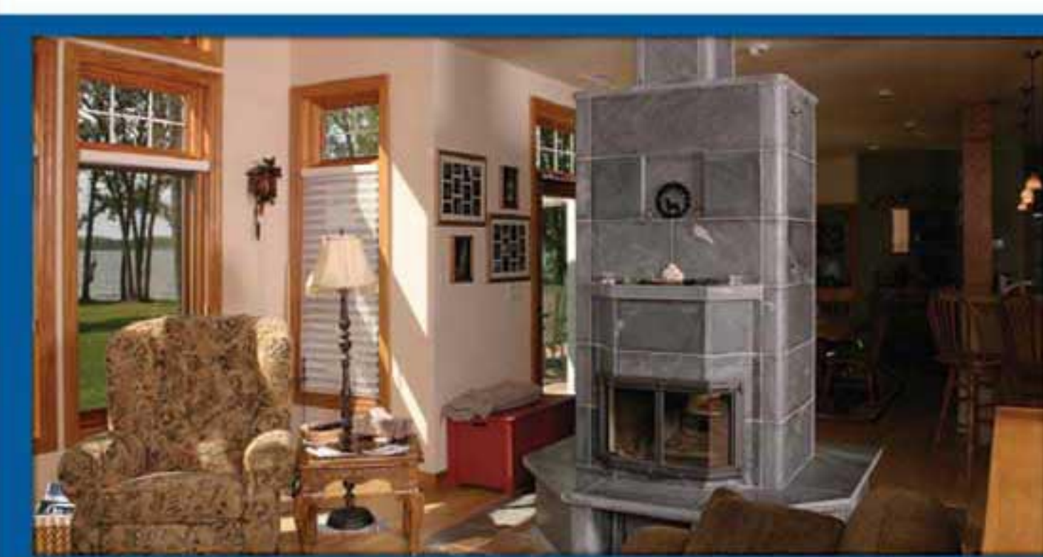
Large windows in the great room will draw attention to the beautiful lake. Also in the great room is the Tulikivi soapstone fireplace.