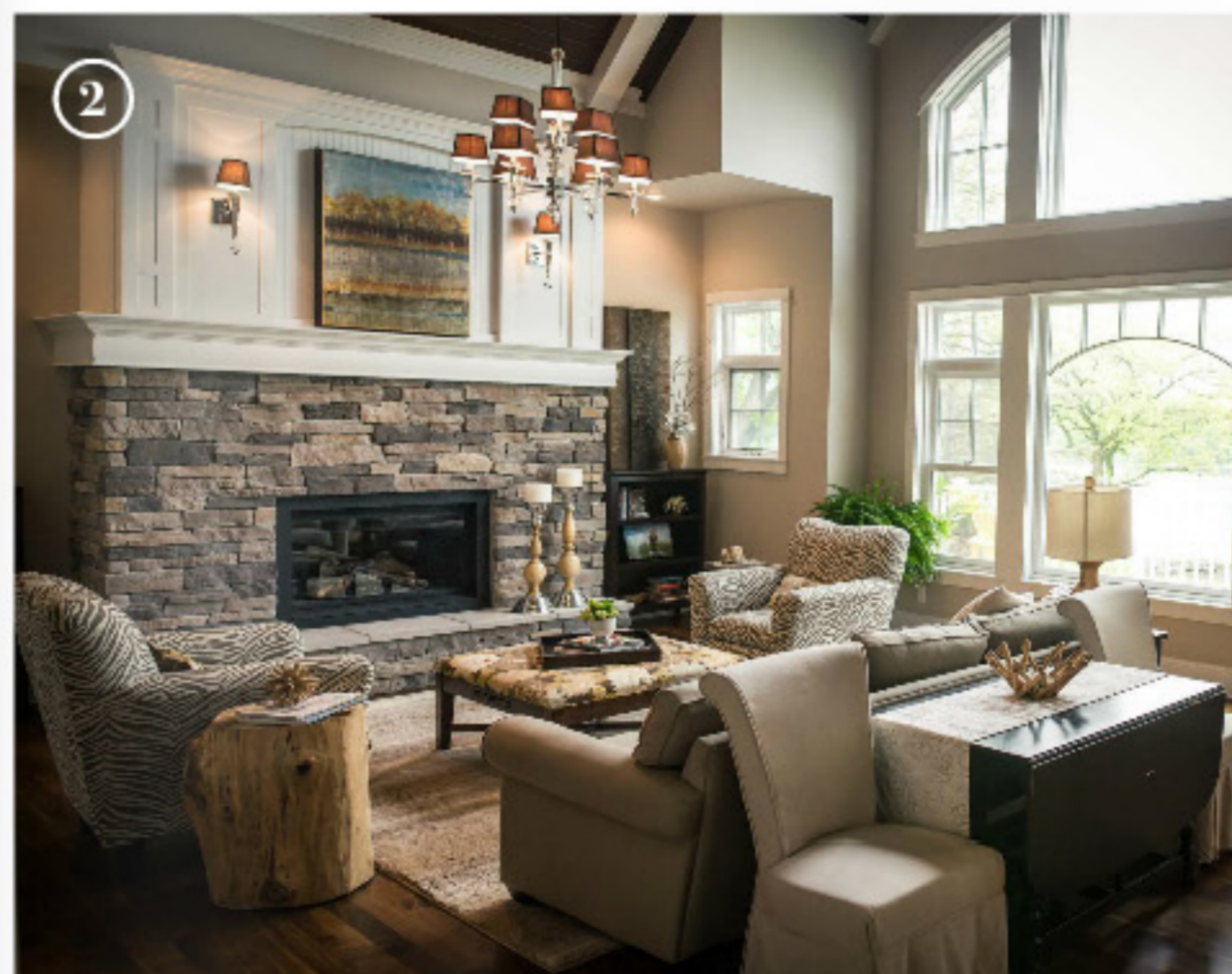
2. The main floor living room has beautiful windows that allow plenty of natural light to pour in.