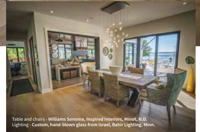
Table and chairs - Williams Sonoma, Inspired Interiors, Minot, N.D. Lighting - Custom, hand-blown glass from Israel, Bahir Lighting, Minn.